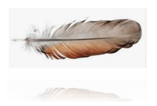
You are the author of your own life story. You can start a new chapter anytime you choose.