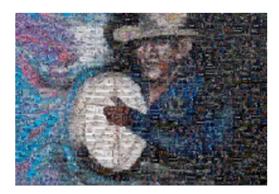
Our Dreams for the Children of the Doig River First Nation are:

Our dream is for our children to have a strong sense of cultural identity, pride in themselves and their community as they achieve high school graduation with the credentials needed for their future goals.